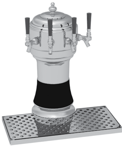
ZT-4-PB (handles not included)

NOTE: To convert standard faucet to stout style faucet, specify accessory model number BT-CFG and add $270 List per faucet.