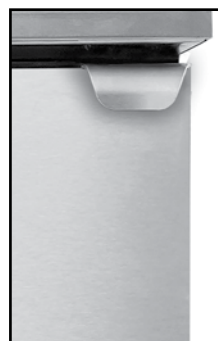
Pull tab handle