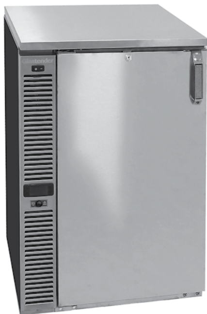
F1SL24 with compressor left, stainless door and top