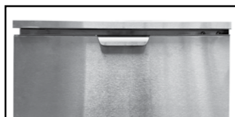
Drawer pull-tab handle