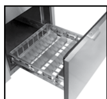
Optional drawers include adjustable divider walls