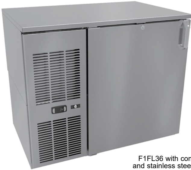
F1FL36 with compressor left and stainless steel door and top