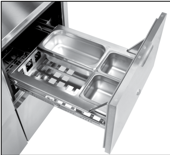
DIP-18 shown Pans not included