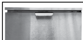
Drawer pull-tab handle