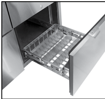
Optional drawers include adjustable divider walls