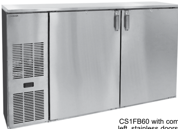
CS1FB60 with compressor left, stainless doors and top