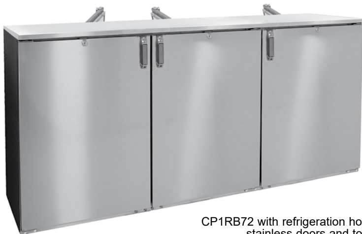
CP1RB72 with refrigeration hook up left, stainless doors and top