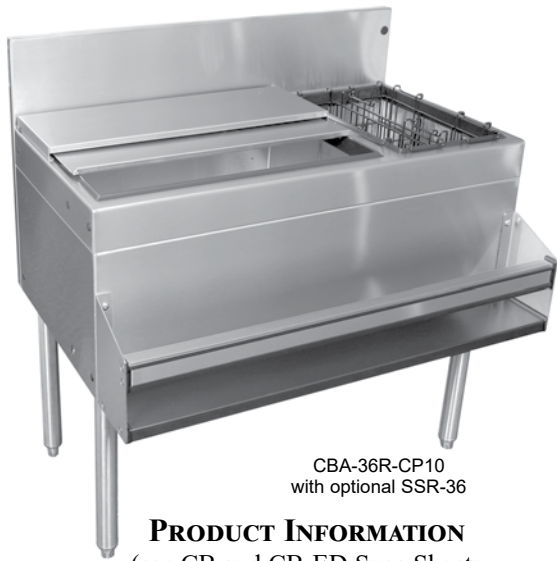
CBA-36R-CP10 with optional SSR-36

PRODUCT INFORMATION (see CB and CB-ED Spec Sheets for complete details)