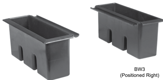
BW3 (Positioned Left)

For four bottles stored on one side of a 24" deep ice bin, order one model number BW4. For four bottles stored on both sides of a 24" deep ice bin, order a quantity of two BW4.