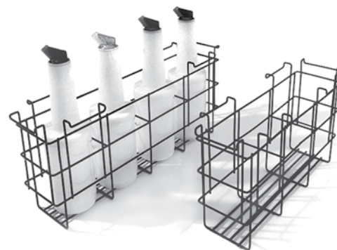
BR4 (Bottles not included)

The BR3 and BR4 are intended for use with smaller ice bins, where the sole purpose of the ice bin is to provide insulated storage for pour and store bottles. Bottle racks are most often used with 6" or 12" wide ice bins, which hold one or two racks, respectively. For example, an IBA-6 ice bin holds one BR3, while an IBA-12 ice bin holds two BR3.