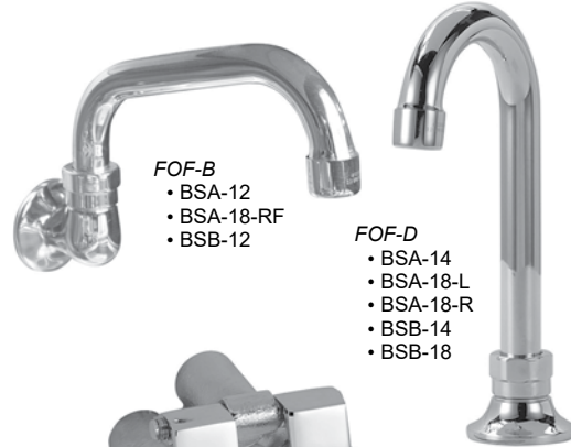
Optional foot-operated faucets