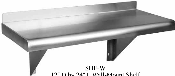
SHF-W 12" D by 24" L Wall-Mount Shelf with rounded nosing profile