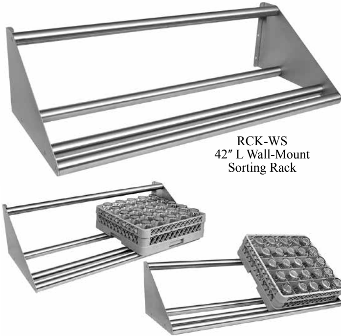
RCK-WS 42" L Wall-Mount Sorting Rack

To view cleaning and care instructions, please visit: http://www.glastender.com/PDF/F-423-011_ss_clean_care.pdf