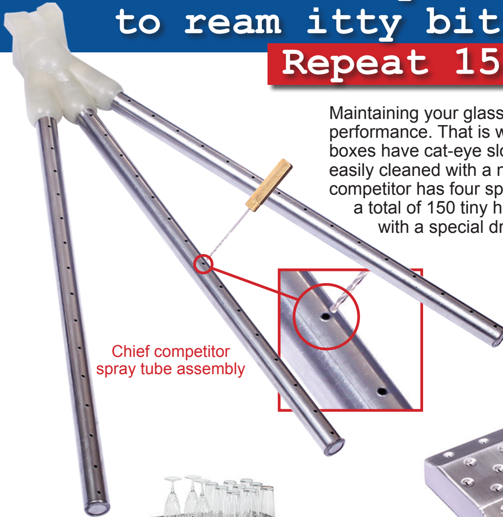
Chief competitor spray tube assembly

Maintaining your glasswasher is key to proper performance. That is why Glastender spray boxes have cat-eye slot nozzles that are easily cleaned with a nylon brush. Our chief competitor has four spray tube assemblies with a total of 150 tiny holes that must be reamed with a special drill bit tool.