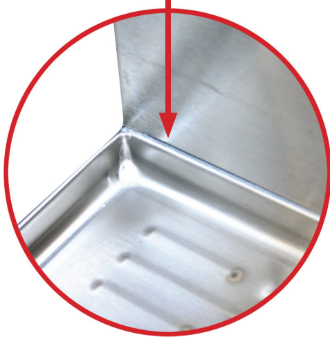
Typical silicone-filled seam design