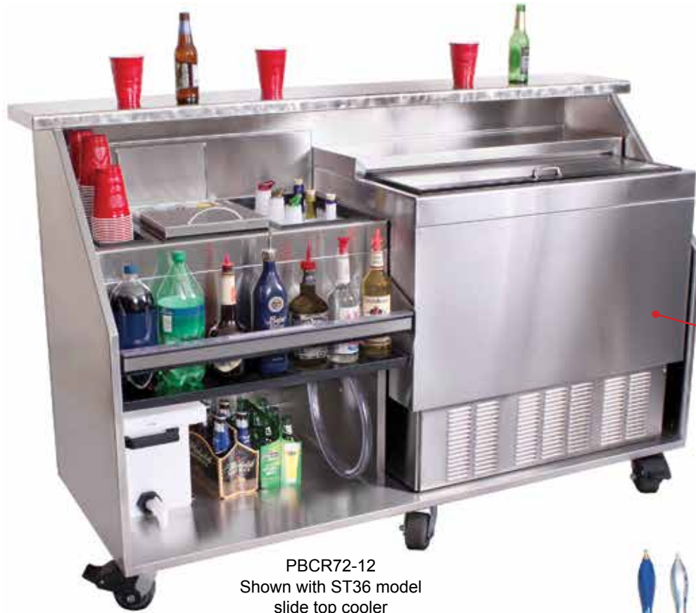
PBCR72-12 Shown with ST36 model side top cooler

PBC models have a cup storage well for three rows up to 4-1/4" in diameter.