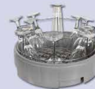
01000536 Stemware rack insert (shown installed in polypropylene glass rack)

Examples of accessories specifically designed for use with the GT-18 series glasswashers are shown below. For a complete list of accessories, please refer to our product directory.