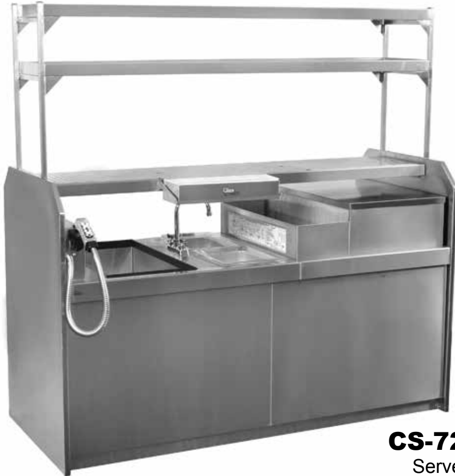
CS-72-CCW Server Side