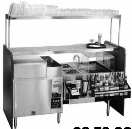
CS-72-CCW Bartender Side