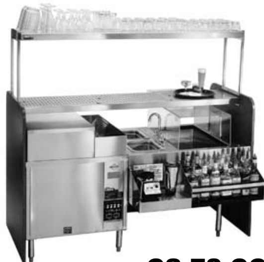
CS-72-CCW Bartender Side