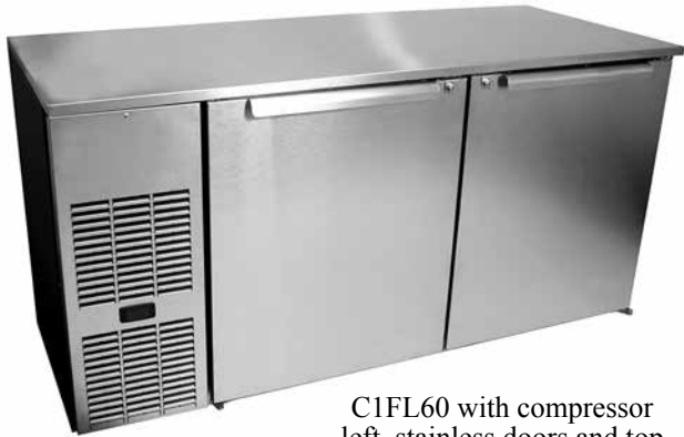
C1FL60 with compressor left, stainless doors and top