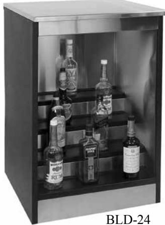
BLD-24 shown with TOP-24-S

BLD-18, BLD-24, BLD-30, BLD-36, BLD-42, BLD-48, BLD-18-S, BLD-24-S, BLD-30-S, BLD-36-S, BLD-42-S, BLD-48-S